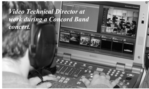
Video Technical Director at work during a Concord Band concert.

The Concord Band has always taken advantage of contemporary technology to support this mission. For decades, we have offered audio recordings, initially on vinyl, and, for many years now, on CD.